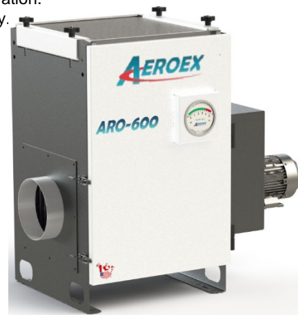
Shown, left hand suction